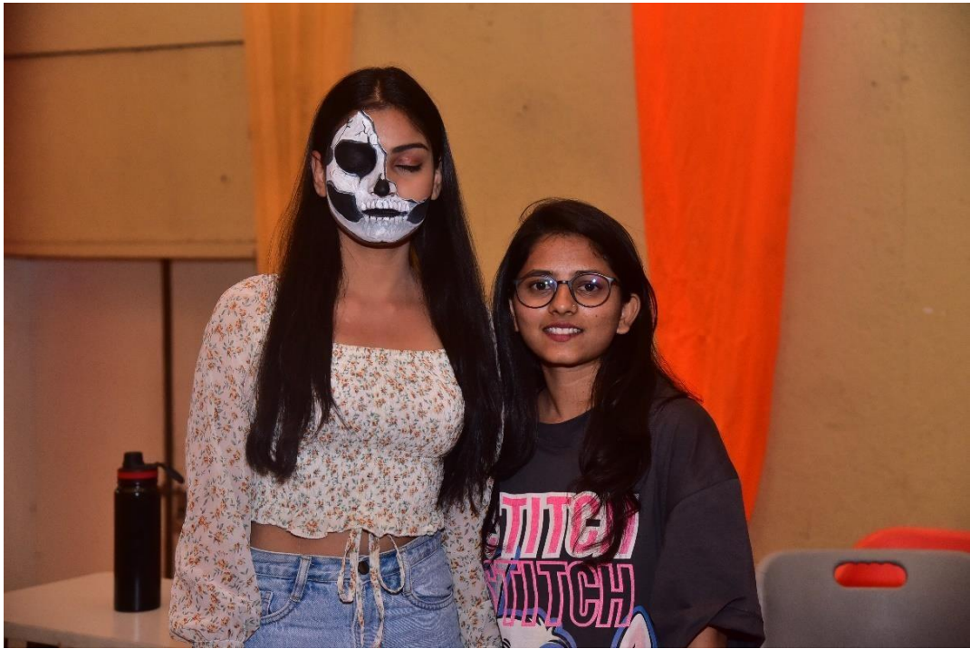
Face Painting Competition