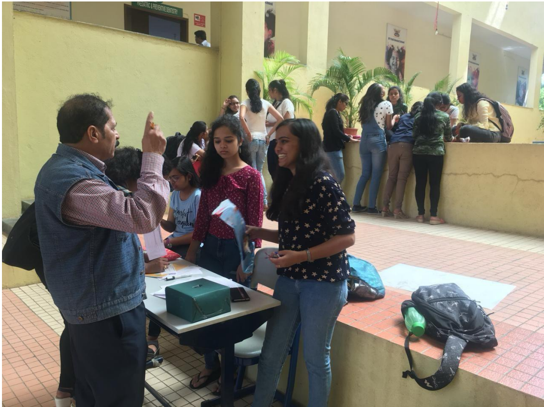
Voting for the Awards for staff and students through a secret ballot