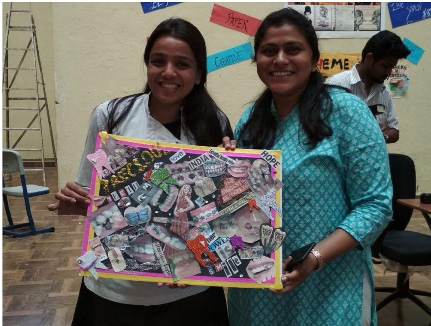
Collage Making Competition