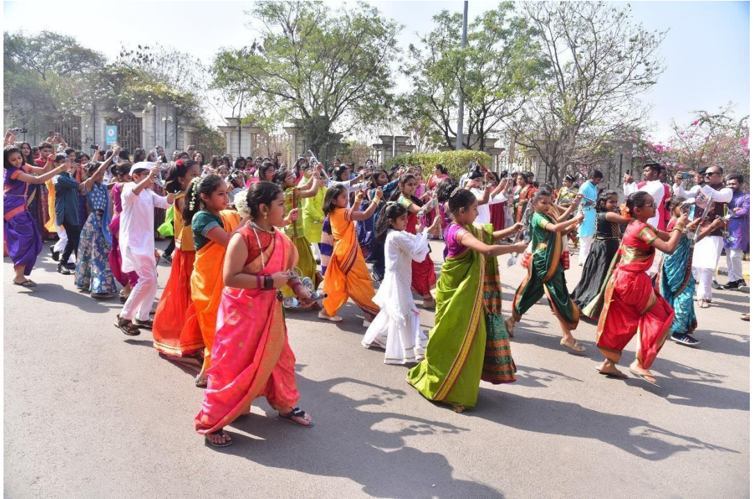
Marathi Bhasha Diwas