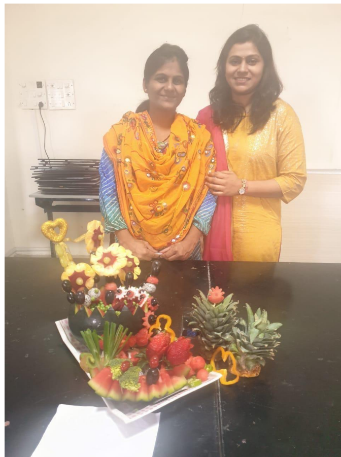
Fruit and Vegetable Carving