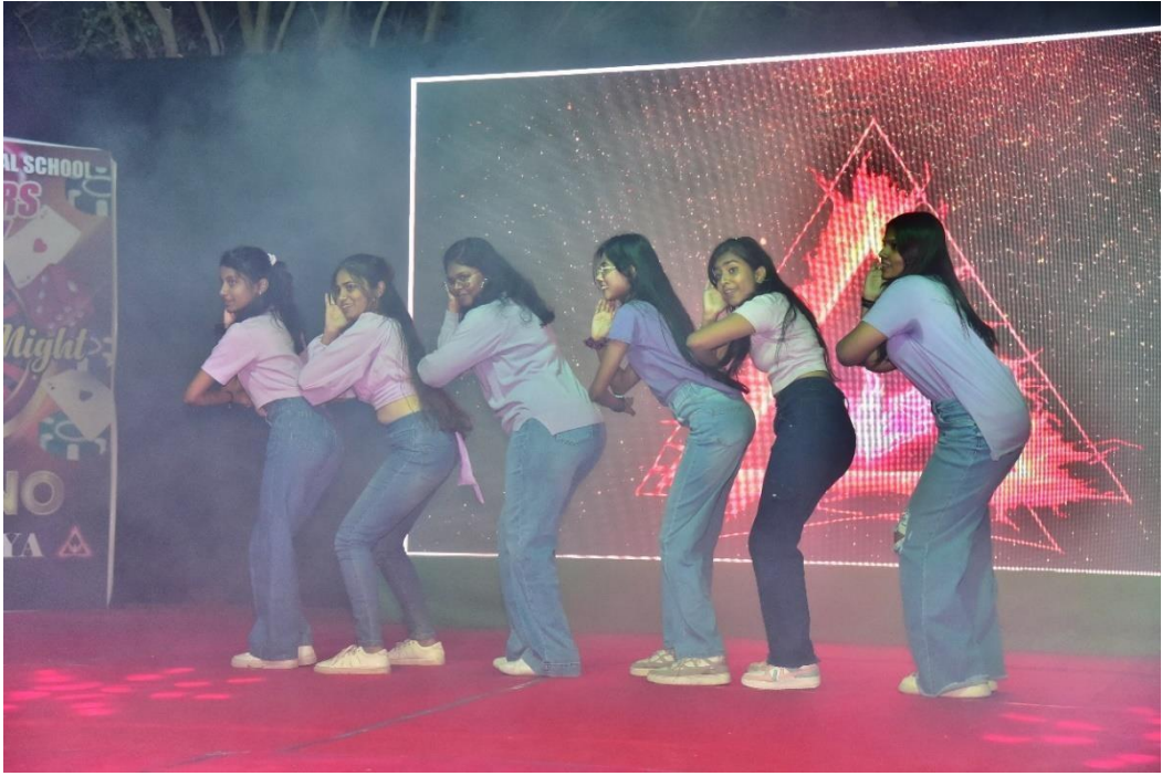
Group Dance Competition