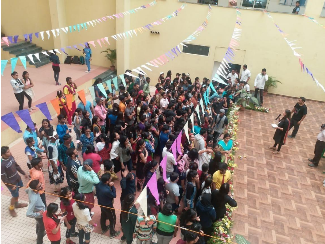
Mad Ad Competition