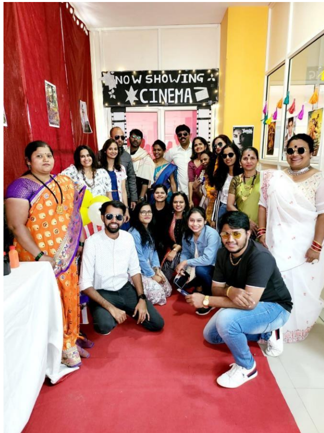
Inter-departmental decoration Competition