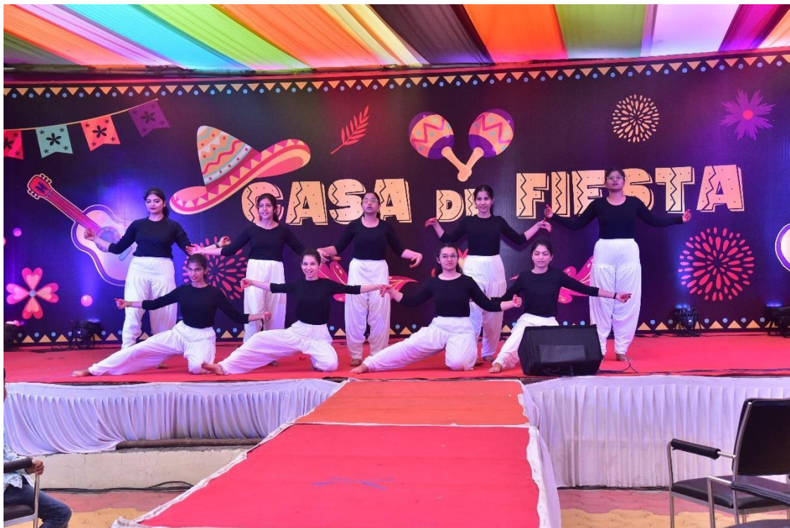
Group Dance Competition