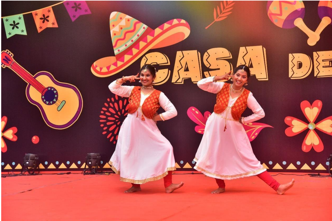
Duet Dance Competition