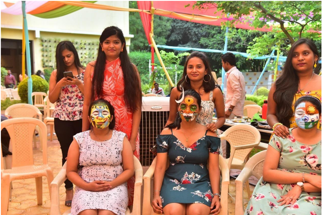
Face Painting competition