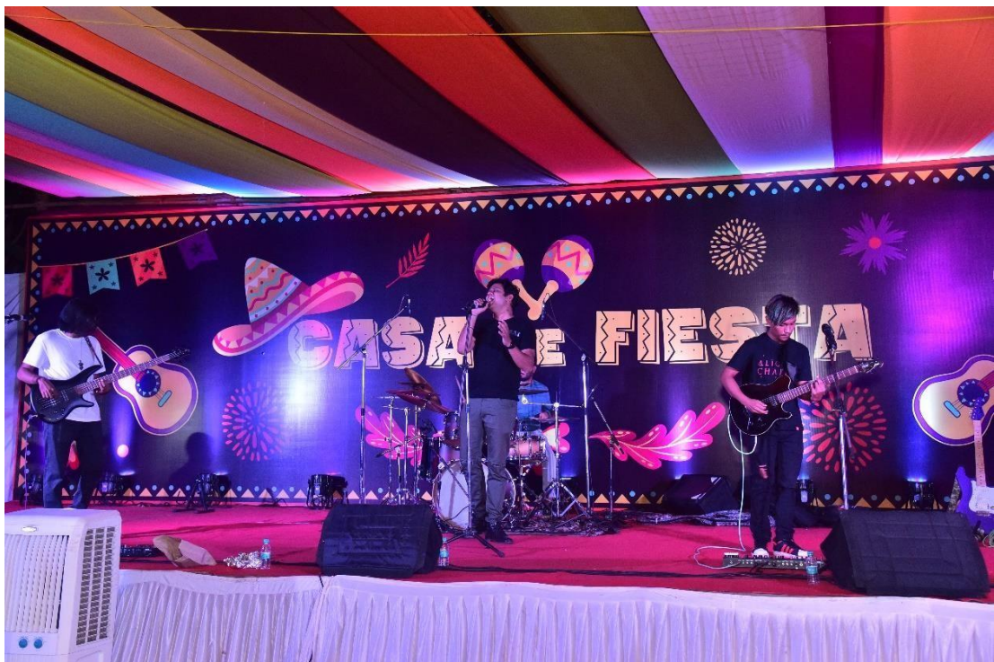
Live concert evening