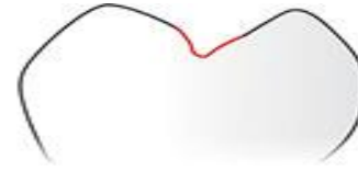
U Type : Almost the same width from top