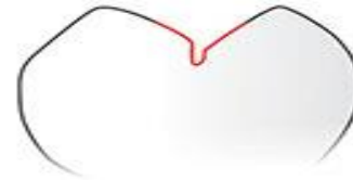
I Type: Extremely narrow slit