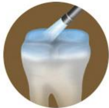
Light-cure it for 20 seconds