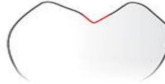
V Type: Wide at top and gradually narrowing at base