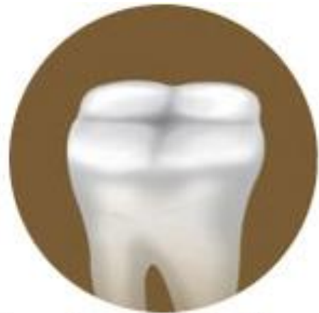
Cleaning Pit & Fissure