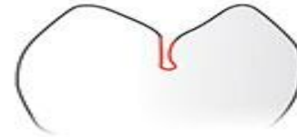
IK Type: Extremely narrow slit with a larger space at bottom